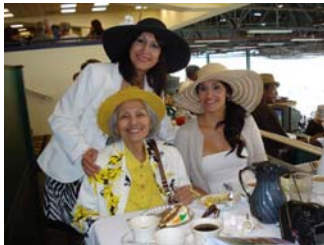
LA Chapter Grand Ladies