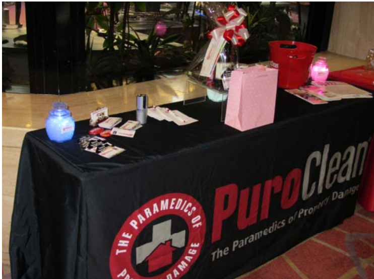
EWI SFV Trade Show Display

Beautiful Displays and the room was filled.