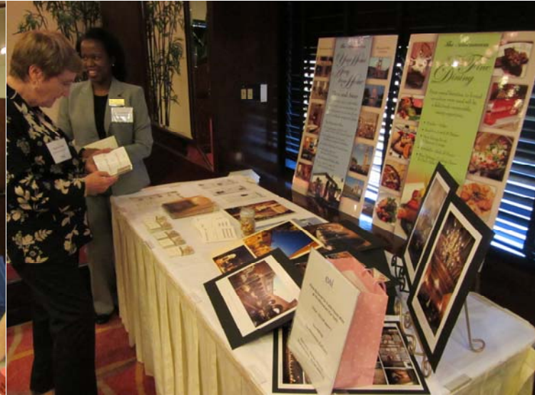
EWI LA Chapter Member, The Athenaeum

Each attendee who set up a table donated a raffle item, some donated two or more. All of the items were very desirable and brought a total of $750. for the evening.