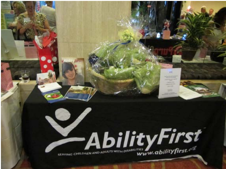
EWI LA Chapter Member Ability First display

Each attendee who set up a table donated a raffle item, some donated two or more. All of the items were very desirable and brought a total of $750. for the evening.