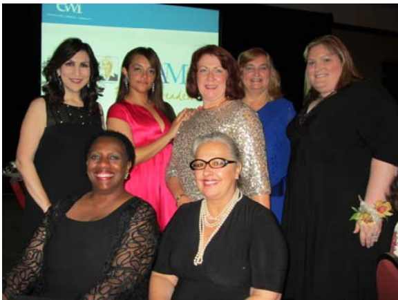
Only one of the group photos, know anyone?